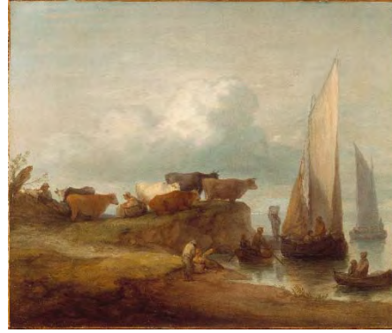
Thomas Gainsborough (1727–1788), A Coastal Landscape , about 1782–84. Oil paint on canvas; 25-1/8 x 30-1/8 in. Gift of the Berger Collection Educational Trust, 2019.13.