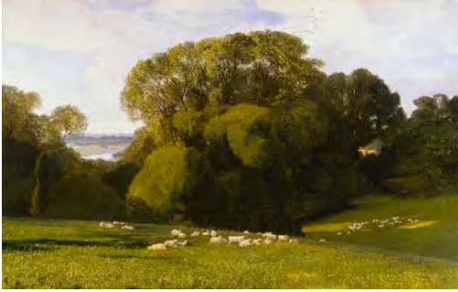
Edward Lear (1812–1888), Nuneham , 1860. Oil paint on canvas; 18-3/4 x 29-1/4 in. Gift of the Berger Collection Educational Trust, 2018.22.