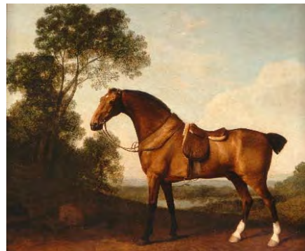
George Stubbs (1724–1806), A Saddled Bay Hunter , 1786. Oil paint on panel; 21-3/4 x 27-3/4 in. Gift of the Berger Collection Educational Trust, 2019.10.