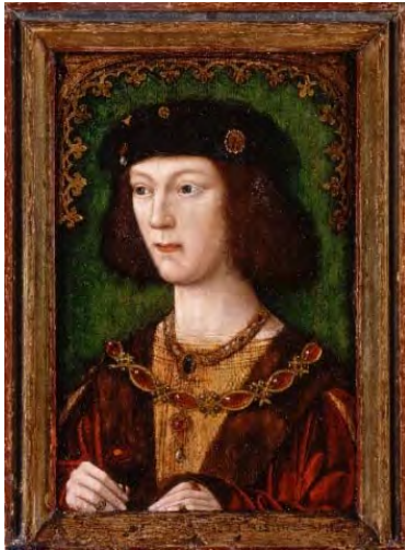
British School, Henry VIII , about 1513. Oil paint on panel, housed in its original frame; 15 x 9-3/4 in. Promised Gift of the Berger Collection Educational Trust, inv. TL-17964.