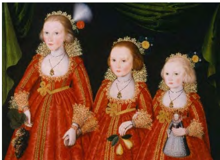
British artist, Three Young Girls , early 1600s. Oil paint on panel; 32-1/2 x 44-3/8 in. Promised Gift of the Berger Collection Educational Trust, TL-18018.