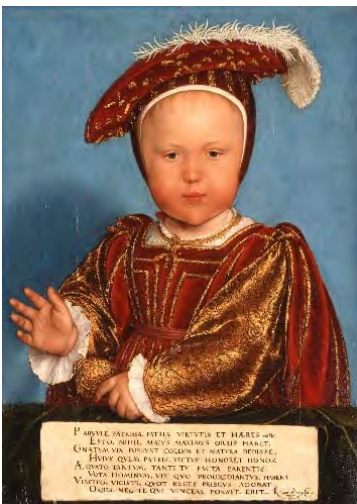
Hans Holbein the Younger and studio (1497/8–1543), Edward, Prince of Wales (later Edward VI) , about 1538. Oil paint on panel; 22-3/4 x 17 in. Promised Gift of the Berger Collection Educational Trust, inv. TL-17310.