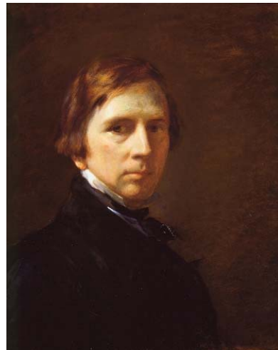
George Richmond (1809–1896), Self-Portrait , about 1840. Oil paint on canvas; 23-1/2 x 18-1/2 in. Gift of the Berger Collection Educational Trust, inv. 2018.27.