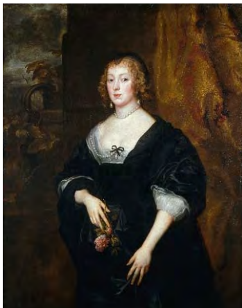
Sir Anthony van Dyck (1599–1641), Dorothy, Lady Dacre , about 1633. Oil paint on canvas; 50 x 40 in. Promised Gift of the Berger Collection Educational Trust, inv. TL-18887.