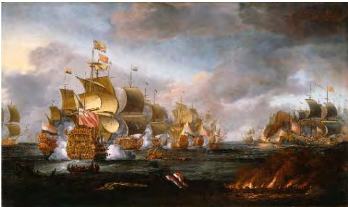
Adriaen van Diest (1655–1704), The Battle of Lowestoft , about 1690. Oil paint on canvas; 40-3/4 x 71-1/4 in. Promised Gift of the Berger Collection Educational Trust, 8.2010.