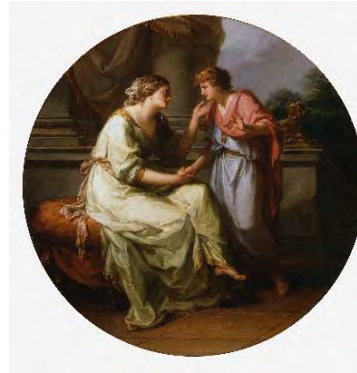
Angelica Kauffman (1741–1807), Papirius Praetextatus Entreated by His Mother to Disclose the Secrets of the Deliberations of the Roman Senate , about 1775–80. Oil paint on canvas; Diameter: 24-1/16 in. Gift of the Berger Collection Educational Trust, 2019.4.