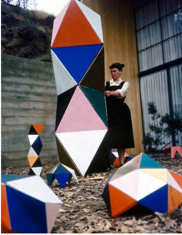
Ray Eames with the first prototype of The Toy , 1950.