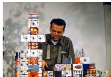
Charles Eames with House of Cards construction, 1952. ©Eames Office LLC (eamesoffice.com)