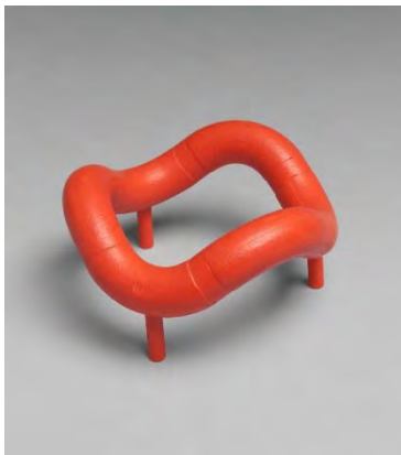
Isamu Noguchi, study model for Play Sculpture, about 1965-68. Plastic; 3/4 × 2-1/2 × 2-1/2 in. The Isamu Noguchi Foundation and Garden Museum, New York. ©The Isamu Noguchi Foundation and Garden Museum, New York / Artists Rights Society (ARS), NY.