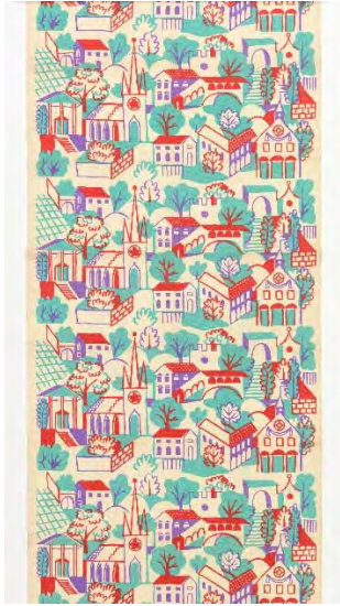
Alexander Girard, Village textile, 1945. Screenprint on linen; 91-3/4 × 35-7/8 in. Cooper Hewitt, Smithsonian Design Museum: Gift of Alexander H. Girard, 1969-1965-59.