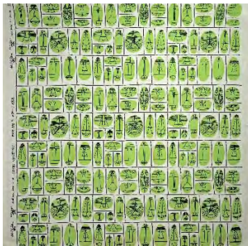
Ray Komai, Masks textile, 1948-49. Screenprint on cotton; 50-3/8 × 52 in. Manufactured by Laverne Originals. Collection of Edgar Orlaineta.