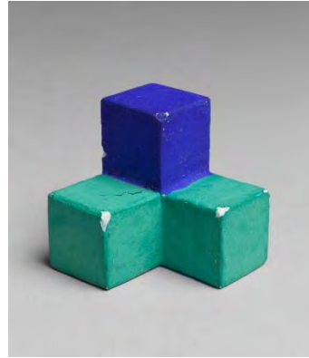
Isamu Noguchi, study model for Play Cubes (4-Cube element), c. 1965-68. Plaster; 1 × 1 × 1 in. The Isamu Noguchi Foundation and Garden Museum, New York. ©The Isamu Noguchi Foundation and Garden Museum, New York / Artists Rights Society (ARS), NY.