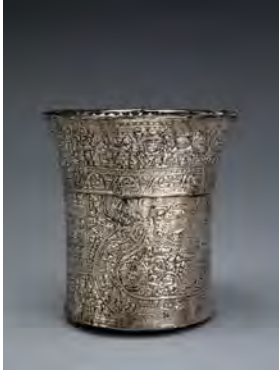
Unknown Artist (Chimú), Double-walled Beaker with Mythological Scene , about A.D. 800-1470. Lambayeque region, Peru. Hammered silver; 6 x 5-1/2 x 4-1/2 in. Denver Art Museum, Gift of Frederick and Jan Mayer, 1969.302.