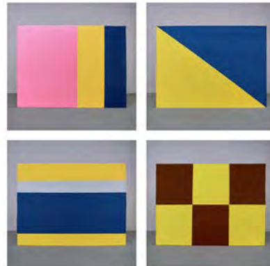
Alexander Apóstol, photographs from the series Partidos Políticos Desaparecidos (Disappeared Political Parties) , 2018. Inkjet prints. Denver Art Museum: Funds from Modern and Contemporary Art and an anonymous donor by exchange (2019.337, 2019.340); Funds from Frederic H. Douglas by exchange (2019.338); Funds from Ethel Sayre Berger by exchange (2019.339) ©Alexander Apóstol.