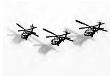
Sandy Rodriguez, Calavera Copters (3) , 2018. Acrylic paint on Plexiglas; 15 x 10 x 1/4 in. Lent by artist.