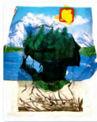
Gary Emrich, All Consumed #37 , 2017. Archival pigment print; 70 x 56 in.