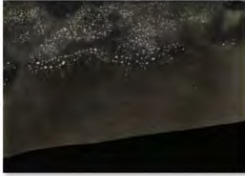
Alison Rossiter, Defender Argo, expired September 1911, processed 2014 , from the series Landscapes . Gelatin silver print; 5 x 7 in. Collection of David and Kathryn Birnbaum. Courtesy Yossi Milo Gallery, New York ©Alison Rossiter