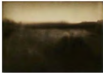
Alison Rossiter, Eastman Kodak Velvet Velox, expired December 1926, processed 2014 , from the series Landscapes . Gelatin silver print; 5 x 7 in.