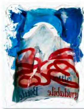
Gary Emrich, All Consumed #48 , 2017. Archival pigment print; 70 x 56 in. Courtesy the artist and Robischon Gallery, Denver. ©Gary Emrich