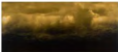
Sami Alkarim, Dream 2 , 2009. Chromogenic color print on aluminum; 52 x 120 in. Gift of Jennifer Doran and Jim Robischon of the Robischon Gallery and an anonymous patron