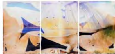
Matthew Brandt, Lake Isabella CA TC 2 , 2014. Three unique chromogenic prints soaked in Lake Isabella water; each element: 65 x 91-13/16 in. Courtesy of Matthew Brandt and Yossi Milo Gallery. ©Matthew Brandt