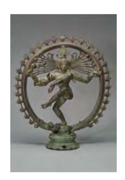
Shiva, King of Dancers (Shiva Nataraja), Tamil Nadu Province India, 1100s. Bronze; 36-7/8 x 32-1/2 in. Denver Art Museum: Dora Porter Mason Collection. 1947.2