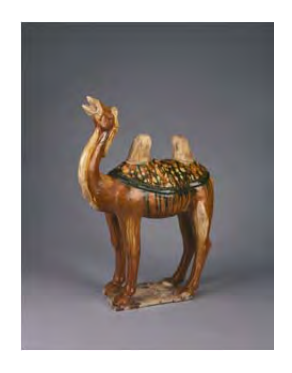
Camel, Tang Dynasty (618–907), China, early 700s. Glazed earthenware; 2-1/4 x 7-3/4 x 18 in. Denver Art Museum: Funds from 1983 Collector's Choice, 1983.243