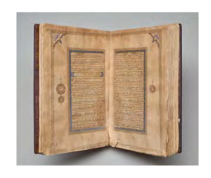
Our'an, Durrani Dynasty (1747–1842), Afghanistan, Herat (perhaps Uzbekistan, Bukhara), 1700s. Ink, gold and colors on paper with painted board covers; 10-1/4 x 7-1/4 in. Denver Art Museum: Gift of Bj Averitt, 1991.748