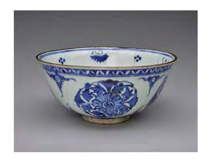
Bowl with Floral Medallions, Safavid Dynasty (1501–1736), Iran, 1600s. Fritware with underglaze blue; 4 x 8-3/4 in. Denver Art Museum: Gift of Bj Averitt, 1994.12