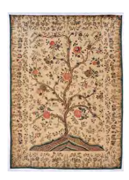
Palampore, India, for the European trade, 1700s–1800s. Cotton, resist dye; 121 x 85-5/8 in. Denver Art Museum Neusteter Textile Collection, 1965.76