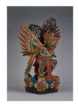
Garuda, Indonesia, Bali, about 1875. Polychromed wood; 29 x 18 x 17-1/4 in. Denver Art Museum: Purchase for the Frederic H. Douglas Collection, 1956.8