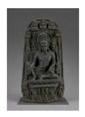
Seated Avalokiteshvara, the Bodhisattva of Compassion, India, 800s–900s. Stone; 32-1/8 x 16-1/2 x 6-1/4 in. Denver Art Museum: Guthrie-Goodwin Collection, 1962.293