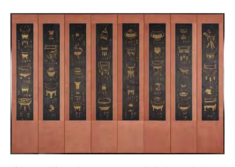
Screen with Ancient Bronzes and Their Inscriptions, Joseon dynasty (1392–1897), Korea, 1800s. Silk, color and gold; 85 x 95-3/4 in. Denver Art Museum: Anonymous gift, 1973.73