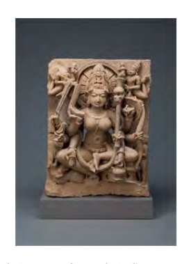
Image of Durga, Central India, 1000s-1100s. Sandstone; 19-3/8 x 14-3/4 x 8 in. Denver Art Museum: Anonymous gift, 1983.266