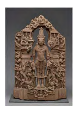
Vishnu, Central India, 1000s–1100s. Sandstone, 33-1/4 x 21 x 7 in. Denver Art Museum: Gift of Mrs. Yuko Shibata, 1986.318