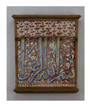
Frieze Tile, Ilkhanid Dynasty (1256–1335), Iran, Kashan, 1200s–1300s. Fritware with lustre and glaze; 21-1/2 x 18-7/8 x 4 in. Denver Art Museum: Museum exchange, 1958.4