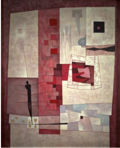
Gunther Gerzso, Portrait of Mr. Jacques Gelman , 1957. Oil on canvas; 28.3 x 23.6 in. (72 x 60 cm). The Vergel Foundation and MondoMostre in collaboration with the Instituto Nacional de Bellas Artes y Literatura (INBAL). © 2020 Artists Rights Society (ARS), New York / SOMAAP, Mexico City.