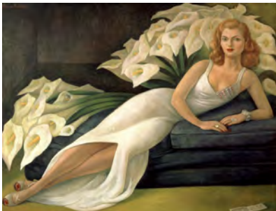
Diego Rivera, Portrait of Natasha Gelman , 1943. Oil on canvas; 45.3 x 60 The Vergel Foundation and MondoMostre in collaboration with the Instituto Nacional de Bellas Artes y Literatura (INBAL). © 2020 Banco de México Diego Rivera Frida Kahlo Museums Trust, Mexico, D.F./Artists Rights Society (ARS), New York.