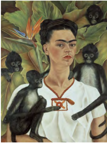
Frida Kahlo, Self-Portrait with Monkeys , 1943. Oil on canvas; 32 x 24.8 in. (81.5 x 63 cm). The Vergel Foundation and MondoMostre in collaboration with the Instituto Nacional de Bellas Artes y Literatura (INBAL). © 2020 Banco de México Diego Rivera Frida Kahlo Museums Trust, Mexico, D.F./Artists Rights Society (ARS), New York.