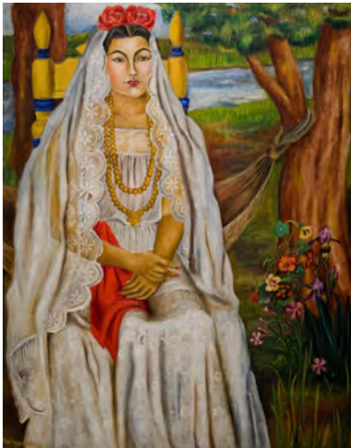
María Izquierdo, Bride from Papantla , 1944. Oil on canvas; 49.2 x 38.4 in. (125 x 100 cm). The Vergel Foundation and MondoMostre in collaboration with the Instituto Nacional de Bellas Artes y Literatura (INBAL). © Estate of María Izquierdo.

Frida Kahlo, Diego Rivera and Mexican Modernism from The Jacques and Natasha Gelman Collection is organized by The Vergel Foundation and MondoMostre in collaboration with the Instituto Nacional de Bellas Artes y Literatura (INBAL). It is presented with generous support from the donors of the Annual Fund Leadership Campaign and the citizens who support the Scientific and Cultural Facilities District (SCFD). Promotional support is provided by 5280 Magazine, CBS4, Comcast Spotlight and The Denver Post .