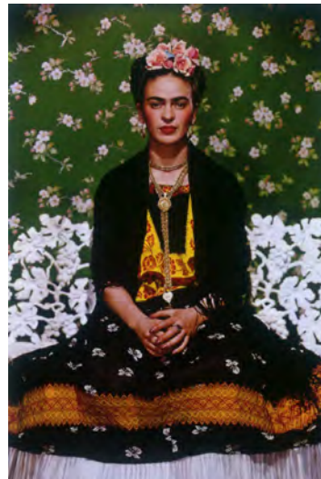
Nickolas Muray, Frida on White Bench #5 , 1939. Carbon print; 40 x 27.3 cm. The Vergel Foundation and MondoMostre in collaboration with the Instituto Nacional de Bellas Artes y Literatura (INBAL).