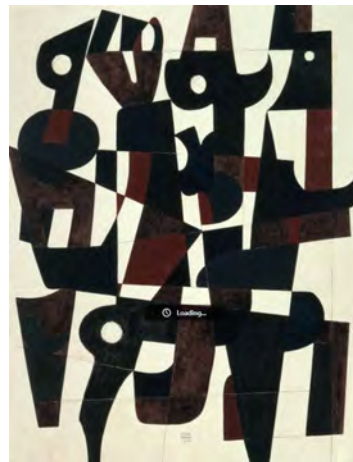
Carlos Mérida, Variation of an Old Theme , 1960. Oil on canvas; 35 x 27.4 in. (89 x 69.5 cm). The Vergel Foundation and MondoMostre in collaboration with the Instituto Nacional de Bellas Artes y Literatura (INBAL). © 2020 Artists Rights Society (ARS), New York/SOMAAP, Mexico City.