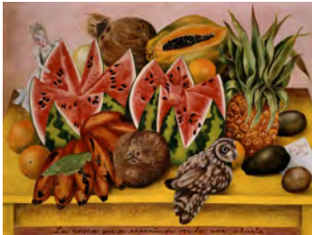
Frida Kahlo, The Bride who Becomes Frightened when she Sees Life Opened , 1943. Oil on canvas; 24.8 x 32.1 in. (63 x 81.5 cm). The Vergel Foundation and MondoMostre in collaboration with the Instituto Nacional de Bellas Artes y Literatura (INBAL). © 2020 Banco de México Diego Rivera Frida Kahlo Museums Trust, Mexico, D.F./Artists Rights Society (ARS), New York.