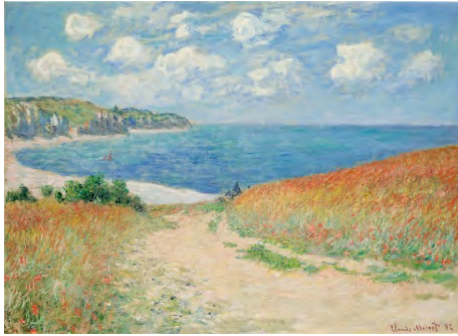
Claude Monet, Path in the Wheat Fields at Pourville , 1882. Oil on canvas; 23 x 30-1/2 in (58.4 x 77.5 cm). Frederic C. Hamilton Collection, bequeathed to the Denver Art Museum, 2016.365.