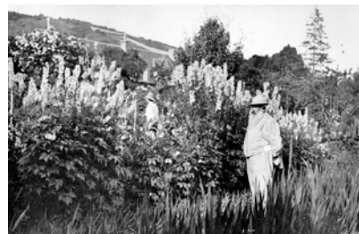
Claude Claude Monet at Giverny, 1908.