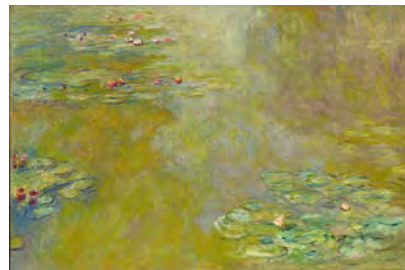
Claude Monet, The Water-Lily Pond , about 1918. Oil on canvas; 51-5/8 x 77-1/2 in (131 x 197 cm). Private collection.