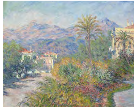
Claude Monet, The Strada Romana at Bordighera , 1884. Oil on canvas; 26 x 32-1/8 in (66 x 81.5 cm). Private collection.