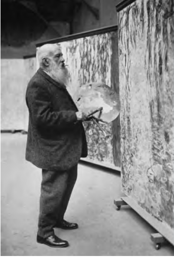
Claude Monet in his studio, 1920.