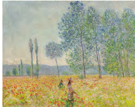
Claude Monet, Under the Poplars , 1887. Oil on canvas; 28-3/4 x 36-1/4 in (73 x 92 cm). Private collection.