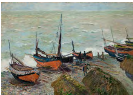
Claude Monet, Fishing Boats , 1883. Oil on canvas; 25-3/4 x 36-1/2 in (65.4 x 92.7 cm). Frederic C. Hamilton Collection, bequeathed to the Denver Art Museum, 37.2017.