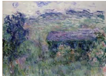
Claude Monet, The House Seen Through the Roses , 1925-26. Oil on canvas; 26 x 32-1/4 in (66 x 82 cm). Collection Stedelijk Museum, Amsterdam.