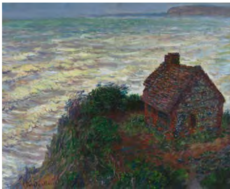
Claude Monet, House of the Customs Officer, Varengeville , 1882. Oil on canvas; 24 x 29 1/2 in. (61 x 74.9 cm). Harvard Art Museums/Fogg Museum; Bequest of Annie Swan Coburn, 1934.27.