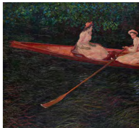
Claude Monet, The Canoe on the Epte , about 1890. Oil on canvas; 52-1/2 x 57-1/2 in (133.5 x 146 cm). Collection Museu de Arte de São Paulo Assis Chateaubriand; Purchase, 1953. Inv. MASP.00092.