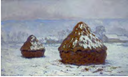
Claude Monet, Grainstacks, Snow Effect , 1891. Oil on canvas, 23 x 39 in. (60 x 100 cm). Collection of Shelburne Museum: Gift of Electra Havemeyer Webb Fund, Inc., 1972-69.1.