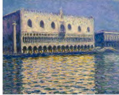
Claude Monet, The Doge's Palace , 1908. Oil on canvas, 32 x 39 in. (81.3 x 99.1 cm). Brooklyn Museum: Gift of A. Augustus Healy, 20.634.