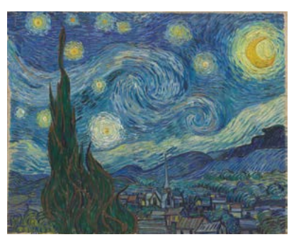
The Museum of Modern Art, New York

Vincent van Gogh (Dutch, 1853-1890) The Starry Night, Saint Rémy, June 1889 Oil on canvas