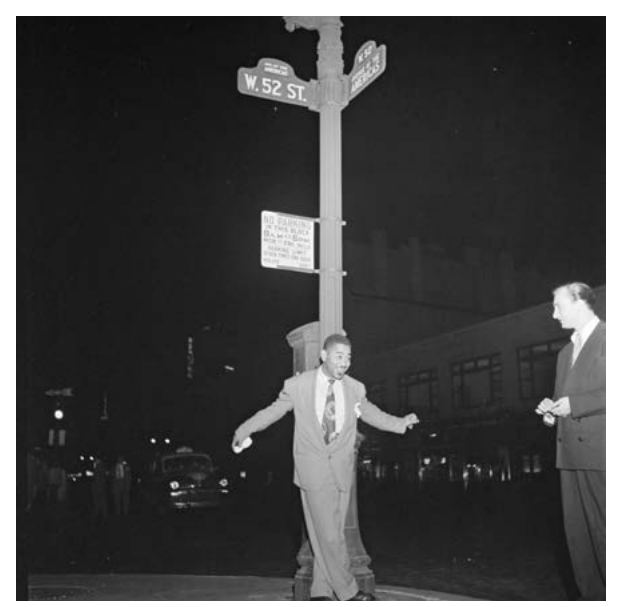
William Gottlieb (American, 1917–2006) Dizzy Gillespie, 52nd St., NYC, 1948, gelatin silver print Bank of America Collection

From Jazz Greats: Classic Photographs from the Bank of America Collection, an Art in our Communities® exhibition