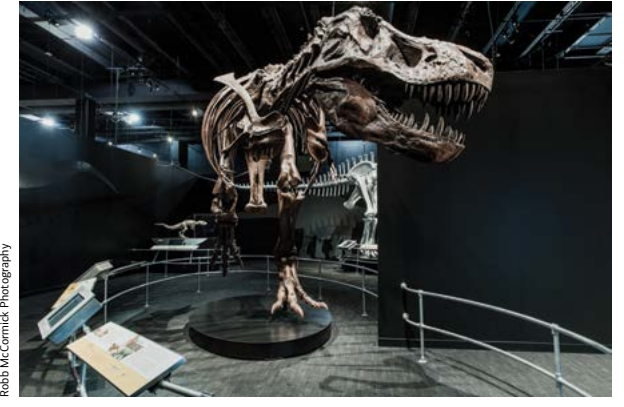
COSI - Center of Science and Industry, Columbus, Ohio

Exhibitions include Shared Space: A New Era at the Art Museum, University of Saint Joseph, West Hartford, Connecticut (Sep. 13 – Dec. 15, 2019); Jazz Greats: Classic Photographs from the Bank of America Collection at the Museum of African American History, Boston (Sep. 19, 2019 – March 30, 2020); Science in Motion at the McClung Museum of Natural History & Culture, Knoxville, Tennessee (Sep. 20, 2019 – Jan. 5, 2020); Luces y Sombras: Images of Mexico at the North Carolina Museum of Art, Raleigh (Oct. 26, 2019 – Feb. 23, 2020); Modern Women/Modern Vision at the Napa Valley Museum, Yountville, California (Nov. 9, 2019 – Jan. 19, 2020); Moment in Time: A Legacy of Photography at the National Gallery of Ireland, Dublin (Nov. 30, 2019 – March 22, 2020); and In a New Light: American Impressionism 1870–1940 at the Butler Institute of American Art, Youngstown, Ohio (Jan. 19 – April 19, 2020).