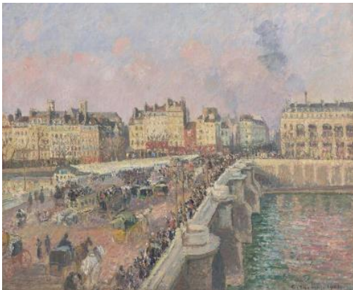
Camille Pissarro, The Pont-Neuf, Afternoon, Sunlight (Le Pont-Neuf, après-midi, soleil) , 1901. Oil on canvas; 28 3/4 × 36 1/4 in. Philadelphia Museum of Art: Bequest of Charlotte Dorrance Wright, 1978.