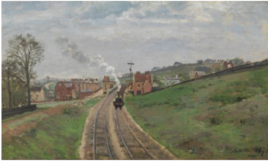
Camille Pissarro, Lordship Lane Station, East Dulwich, 1871 . Oil on canvas; 17 1/2 × 28 1/2 in. Courtauld Gallery, London: Bequeathed by Samuel Courtauld, 1948.