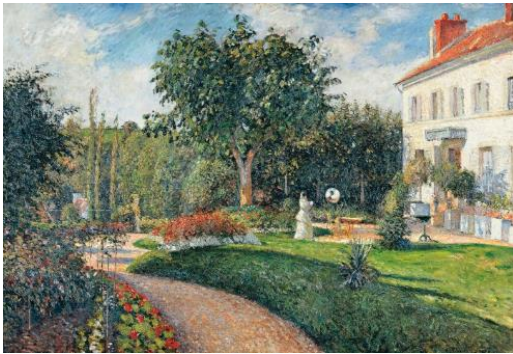
Camille Pissarro, The Garden of Les Mathurins, property of the Deraismes Sisters, Pontoise (Le Jardin des Mathurins, Pontoise, propriété des soeurs Deraismes) , 1876. Oil on canvas; 44 5/8 × 65 1/8 in. The Nelson-Atkins Museum of Art, Kansas City, Missouri: Purchase: William Rockhill Nelson Trust.