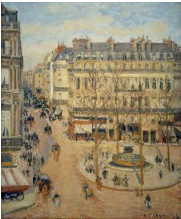
Morning Sun in the Rue Saint-Honoré. Place du Théâtre Français (La Rue Saint-Honoré, matin, effet de soleil)

Camille Pissarro, Morning Sun in the Rue Saint-Honoré. Place du Théâtre Français (La Rue Saint-Honoré, matin, effet de soleil) , 1898. Oil on canvas; 25 7/8 × 21 1/4 in. Ordrupgaard, Charlottenlund.