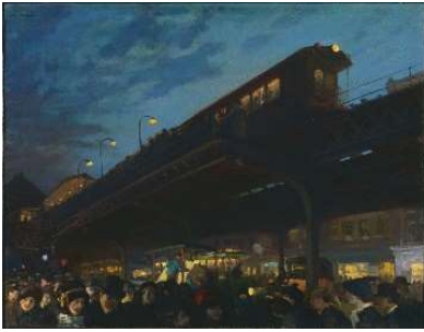
John Sloan, Six O'Clock, Winter , 1912. Oil on canvas; 26-1/8 x 32 in. The Phillips Collection: Acquired 1922.