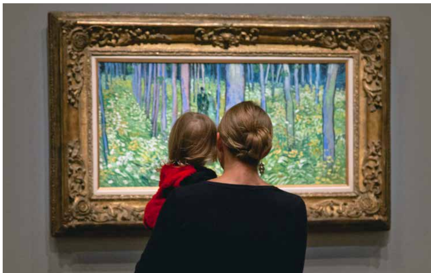
Becoming Van Gogh.

The Denver Art Museum highlighted the creativity of individual artists and the artistic journey in 2013, and record numbers of enthusiastic visitors joined us for this yearlong celebration. Our visitors looked in-depth at artists' intensely personal and diverse creative processes, from exploring the evolution of Vincent Van Gogh to the playfulness of Nick Cave, in media ranging from painting to photography, sculpture to video.