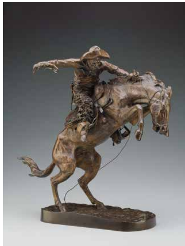
Frederic Remington, The Broncho Buster , first modeled in 1895, cast before January 1906. The Roath Collection, 2013.92.

President & Chairman, Board of Directors Denver Art Museum Foundation