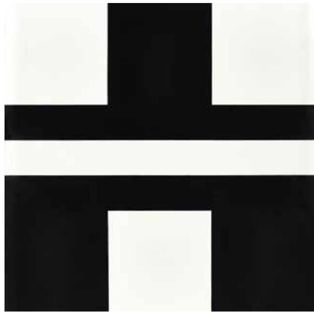
Frederick Hammersley, Black and forth #3, 1971. Museum purchase with funds from an anonymous donor, 2012.316. © Frederick Hammersley Foundation.