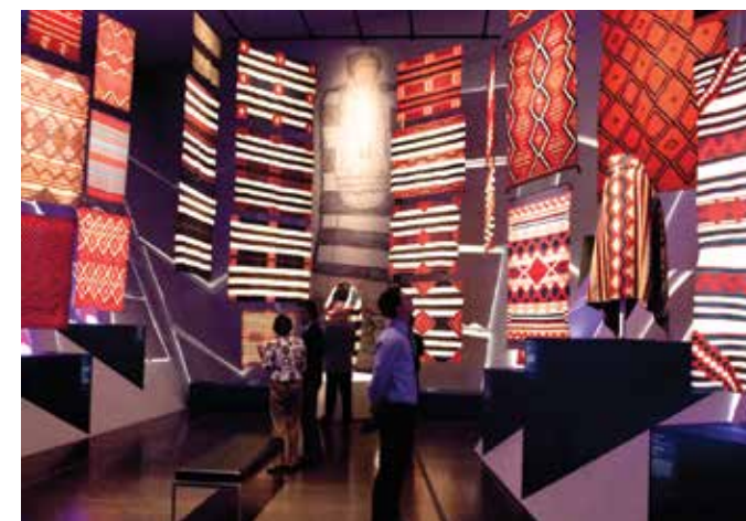
Red, White, and Bold: Masterworks of Navajo Design, 1840-1870.

Significant funding is provided by the citizens who support the Scientific and Cultural Facilities District (SCFD) and the donors to the Annual Fund Leadership Campaign.