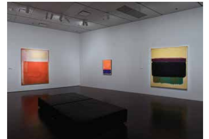
Figure to Field: Mark Rothko in the 1940s June 23–September 29, 2013. © 1998 Kate Rothko Prizel & Christopher Rothko/Artists Rights Society (ARS), New York.