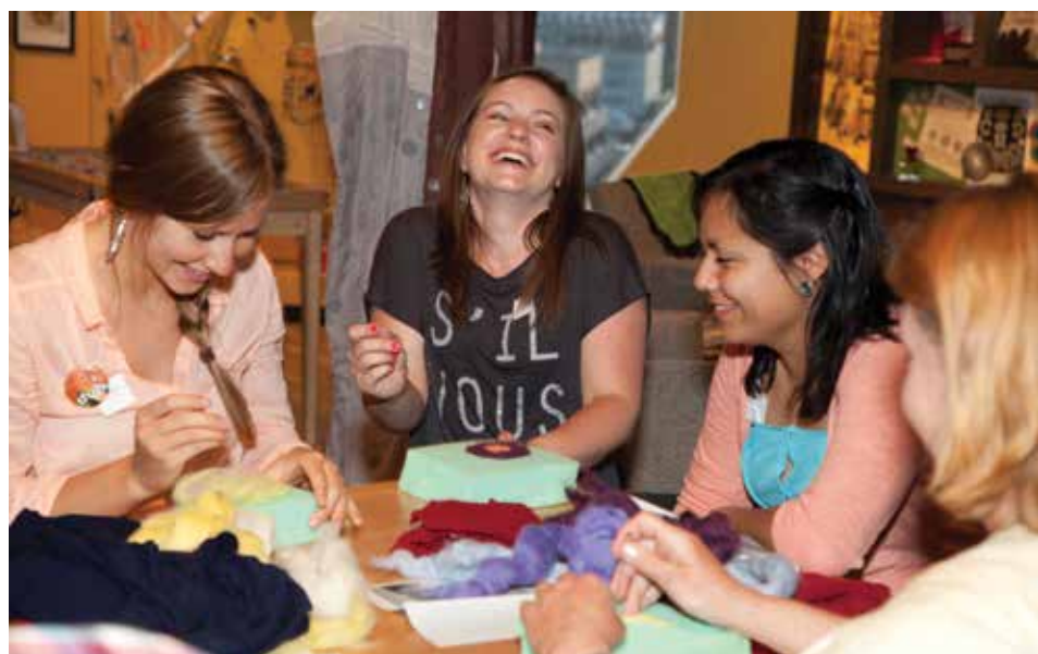
Untitled #57 (Darn).