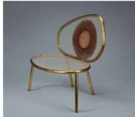
Fernando Campana and Humberto Campana, Racket Chair (Tennis) , 2013. Funds from the Florence R. & Ralph L. Burgess Trust, 2013.90.