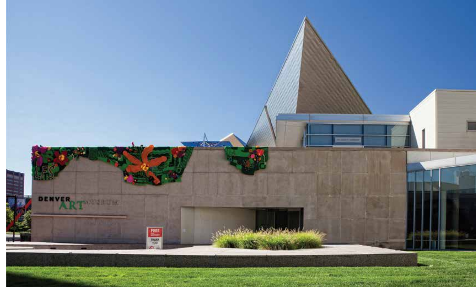
Garden of the DAM(ed) , created by Ladies Fancywork Society for Spun .

Bonampak Murals: The Spectacle of the Maya Court