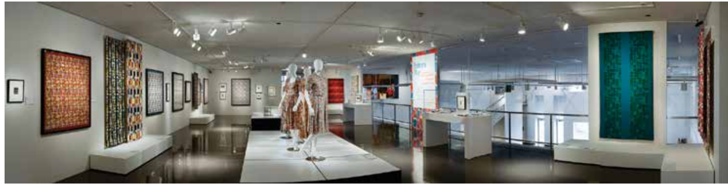
Pattern Play: The Contemporary Designs of Jacqueline Groag.