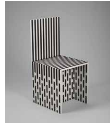
Nendo, Visible Structures: Chair (White) , 2011. Purchased with funds contributed by Design Council of the Denver Art Museum, 2013.60.