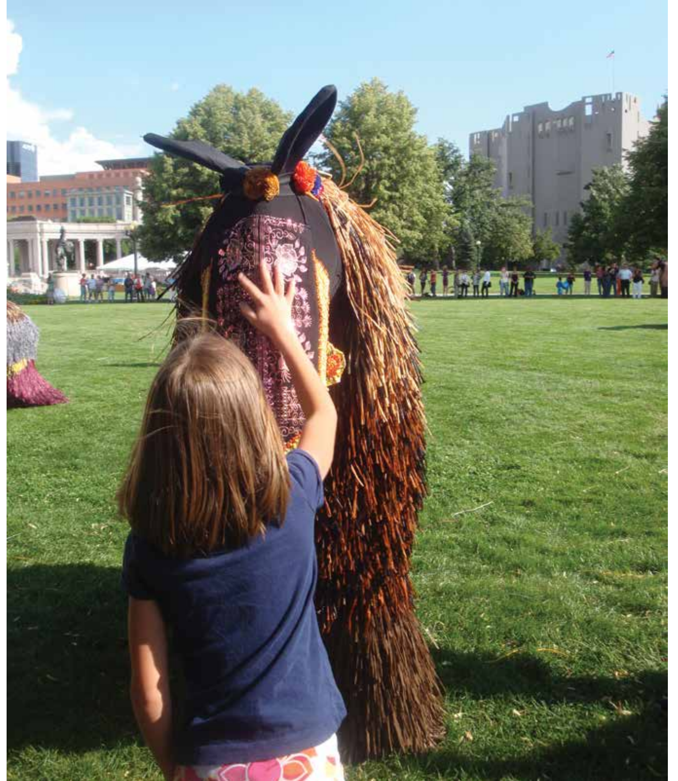
Cover: Nick Cave, Untitled , 2013. Purchased with Modern and Contemporary Art acquisition funds and the support of Vicki and Kent Logan, 2013.76. Courtesy of the artist and Jack Shainman Gallery, New York. Photo courtesy of James Prinz.