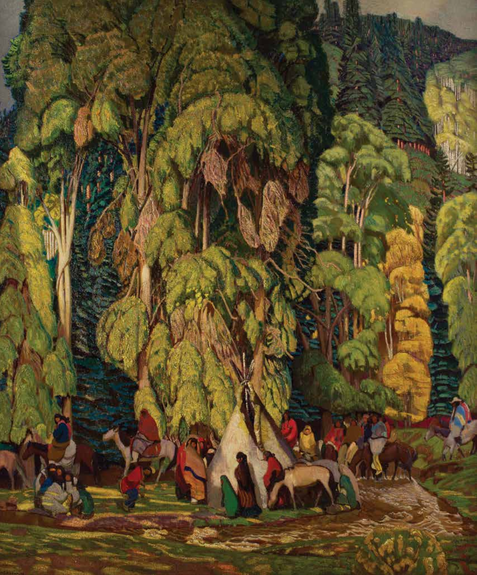
Ernest L. Blumenschein, Landscape with Indian Camp , 1920, reworked 1929. The Roath Collection, 2013.137.