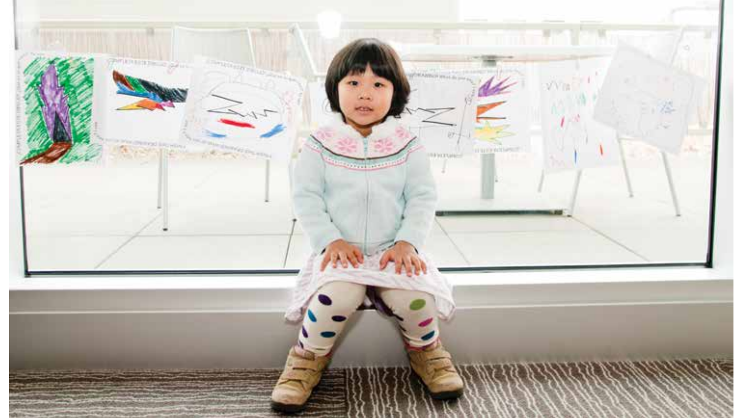
Families had a “block party,” explored the the dollhouse, and played dress-up in the Just for Fun Center located in newly remodeled Duncan Pavilion.