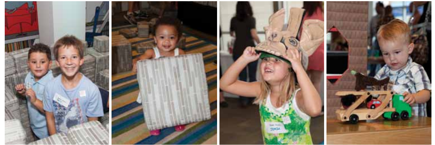
Families had a "block party," explored the the dollhouse, and played dress-up in the Just for Fun Center located in newly remodeled Duncan Pavilion.

Deciphering & Implementing the New Academic Standards (in collaboration with Colorado Department of Education, Opera Colorado, Colorado Symphony, and Buntport Theater) Looking At Photography