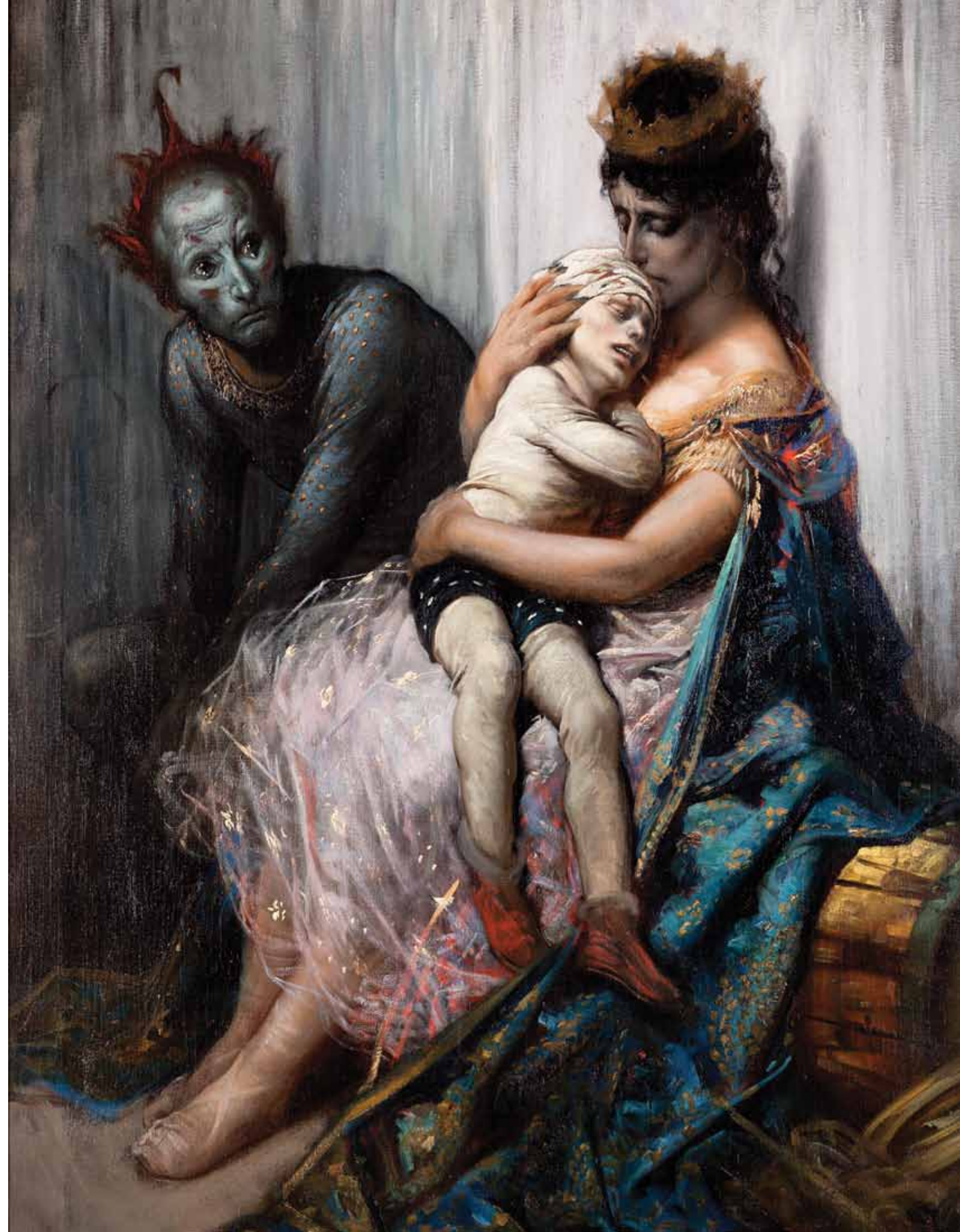
Right: Gustave Doré, La Famille du Saltimbanque: L'Enfant Blessé (The Family of Street Acrobats: the injured child) , about 1853. Painting and sculpture deaccession funds, 2012.4.