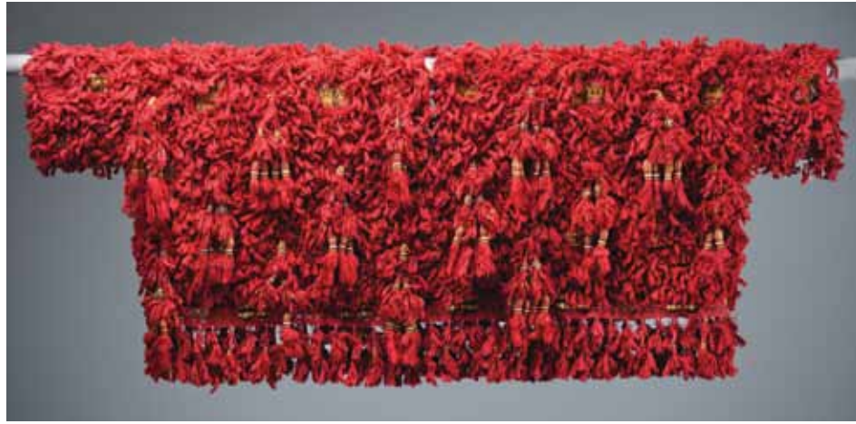
Tasseled Tunic , Chimu Culture, Peru, A.D. 900–1400. Neusteter Textile Collection: Gift in memory of Richard Levine, 2011.358.

5280 Magazine AEG Europe American Museum of Western Art Applejack Wine & Spirits