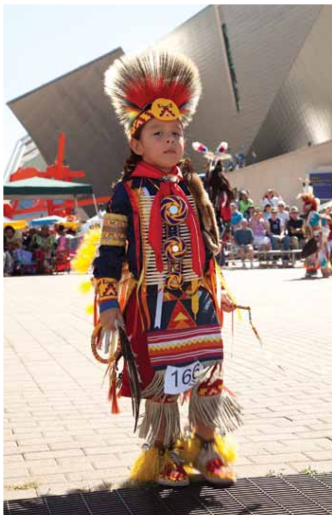
Dancers of all ages gathered at the 23rd annual Friendship Powwow and American Indian Cultural Celebration, one of the DAM's longest-running community events.