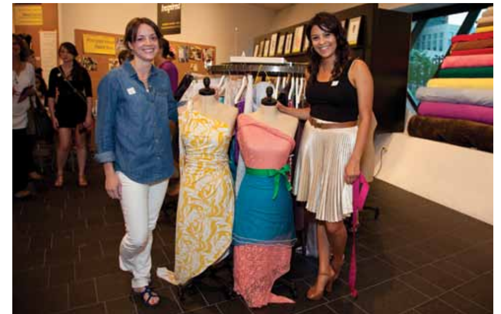
Fashion Studio offered visitors a variety of ways to engage with the artistic process behind haute couture.