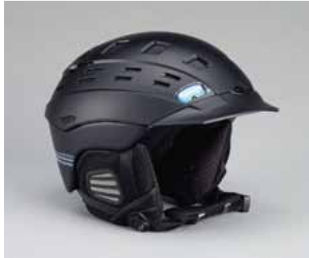
Jackalope Studios and Smith Optics, Variant Brim Helmet , 2007. Gift of Smith Optics, 2012.7.