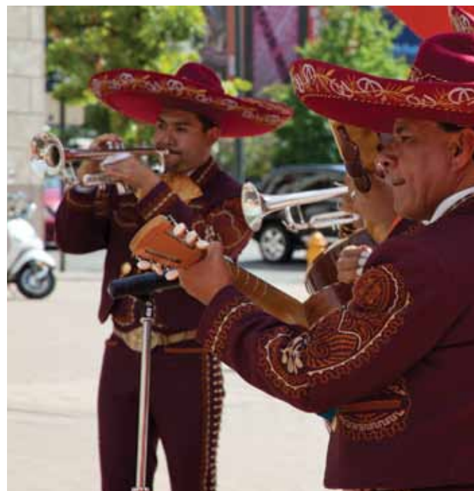
CelebrARTE, the DAM's new monthly bilingual program, included music from Mariachi Sol de mi Tierra.

Untitled , the museum's final Friday event, celebrated its sixth season and continued to expand its network of partners including the Denver Museum of Nature & Science, the Denver Design Incubator, and Denver Public Library's Fresh City Life. New programs like the Pairings series engaged multiple senses by fusing art with wine, music, and perfume.