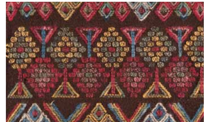
Charkheb (rain cloak) (detail), early 1900s. Neusteter Textile Collection: Textile art department funds, by exchange, 2012.291.