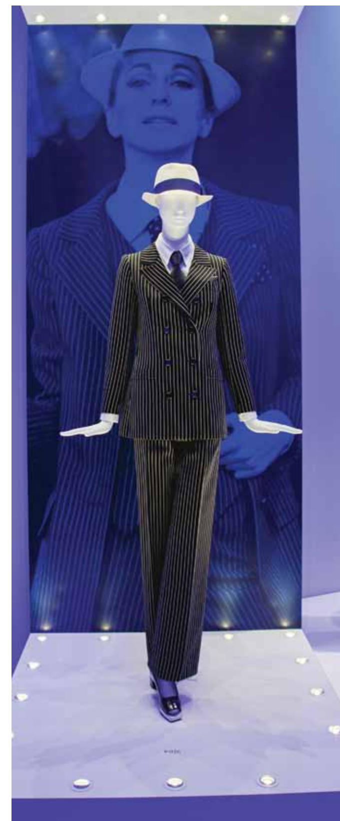
A sweeping retrospective of the fashion designer's forty years of creativity, Yves Saint Laurent: The Retrospective featured 200 haute couture garments.