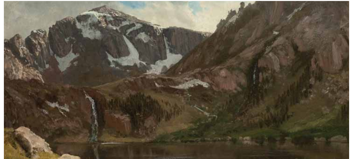
Albert Bierstadt, Mountain Lake (detail), 1863. Gift of HRH Prince Bandar Bin Sultan Bin Abdulaziz, 2012.278.