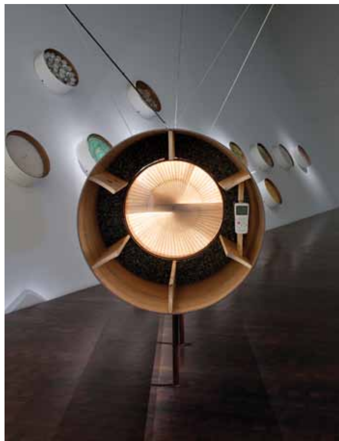
Design Lab: Three Studios featured works by innovative Denver designers tres birds workshop, DoubleButter, and MATTER.

In this past year, the Denver Art Museum surged with the creative energy of retrospectives, residencies, and nearly everything in between. The museum illuminated the creative process through icons like Yves Saint Laurent and Denver's most innovative designers. We explored creativity on-site, online, and through the eyes and hands of visitors.