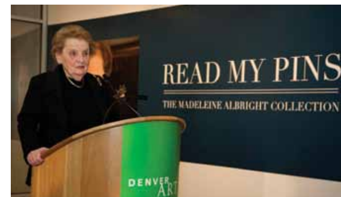
Madeleine Albright shared stories of diplomacy through her collection of pins.

Ed Ruscha: On The Road was organized by the Hammer Museum, Los Angeles. The exhibition was made possible by a major gift