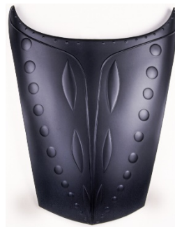
Carlotta Boettcher, 13 Moons Doubled , 1992. Citroen DSL hood, aluminum, and lacquer, matte black; 70 x 60 in. Collection of the Tucson Museum of Art: Gift of Ana Livingston Paddock, 2010.2.1. © and courtesy Carlotta Boettcher