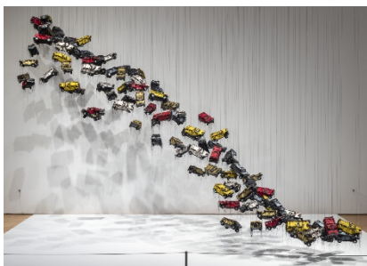
Margarita Cabrera, Agua que no has de beber dejala correr (Water That You Should Not Drink, Let It Run) , 2006–2022. Vinyl and thread with model parts; overall: 180 x 120 in., each Hummer: 4 1/2 x 10 x 6 in. Collection of the artist and courtesy of Tally Dunn Gallery, Dallas, Texas. © 2023 Margarita Cabrera/Licensed by VAGA at Artists Rights Society (ARS), NY).

Agua que no has de beber dejala correr (Water That You Should Not Drink, Let It Run)