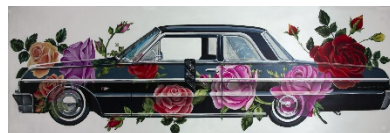
Nanibah Chacon, What Dreams Are Made Of , 2018. Acrylic paint on Polytab; 6 x 17 ft.. Collection of the artist. © and courtesy of Nanibah Chacon. Photo provided by artist Nani Chacon