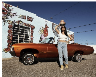
Cara Romero (Chemehuevi), Liquid Sunshine (Sol Liquid) , 2021. Digital chromogenic print; 24 x 32 in.