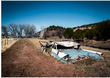
Carlotta Boettcher, Cars in the New Mexico Landscape Collection , 1996–97. Digital print on cotton rag paper, mounted on Diebond aluminum support; 15 1/2 x 23 1/2 in. Collection of the artist. © Carlotta Boettcher

Cars in the New Mexico Landscape Collection