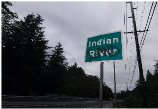
Nicholas Galanin (Tlingit/Unangaxx^, b. 1979), Get Comfortable , 2012. Chromogenic print. Amon Carter Museum of American Art, Fort Worth, Texas, P2021.42. © Nicholas Galanin