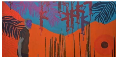
Tessa Mars, Untitled, Praying for the visa , 2019. ©Tessa Mars. Photo: Tessa Mars.