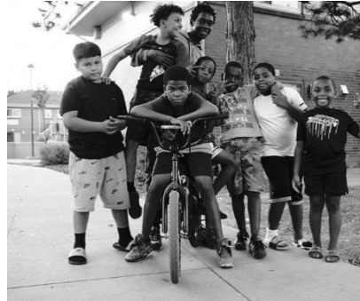
Juan Fuentes, Westwood Kids , 2020. ©Juan Fuentes. Photo: Juan Fuentes.