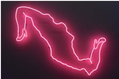
Alan Sierra, Sin título (Mapa de México) [Untitled (Map of Mexico)] , 2020. ©Alan Sierra.