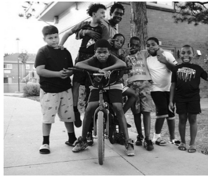
Juan Fuentes, Westwood Kids , 2020. ©Juan Fuentes. Photo: Juan Fuentes.