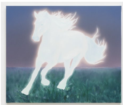
Caleb Hahne Quintana, Limpia , 2021. Oil paint, acrylic paint, flashe, and wax on canvas. ©Caleb Hahne Quintana/ Photo by Thomas Mueller.