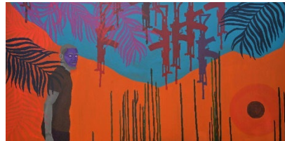
Tessa Mars, Untitled, Praying for the visa , 2019. ©Tessa Mars. Photo: Tessa Mars.