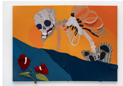
Yuli Yamagata, Summer sweaty dream , 2021. Elastane, velvet, felt, silk, silicone fiber, sewing thread. ©Yuli Yamagata/Photo by Eduardo Ortega, courtesy of Fortes D'Aloia & Gabriel, São Paulo/Rio de Janeiro.