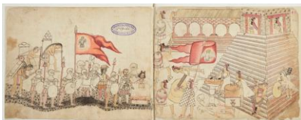
Unknown artist, Mexico, Spaniards on the march to Tenochtitlan , Codex Azcatitlan. 16th century. Ink on amate paper; 8-1/4 x 11 in. Bibliothèque Nationale de France, Paris.