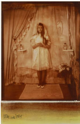
Delilah Montoya, La Malinche , 1993. Collotype; 21-1/2 x 17 x 1-1/4 in. The Abarca Family Collection. ©Delilah Montoya. Photography courtesy Denver Art Museum.