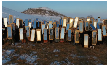
Mirror Shield Project