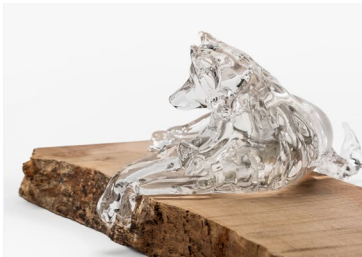
Marie Watt, Companion Species (Radiant) , 2017. Crystal and western maple base; 8 x 27 x 16 in. © Marie Watt. Made in collaboration with Jeff Mack, Glassblower, and Corning Museum of Glass Hot Glass Team in Partnership with the Rockwell Museum, Corning, NY.