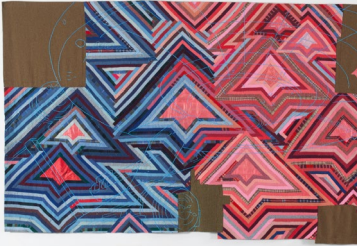
Marie Watt, Trek (Pleiades) , 2014. Reclaimed wool blankets, satin binding, embroidery floss, and thread; 74 x 123 in. Courtesy of the Tia Collection. Image courtesy of the artist. Photograph by Aaron Johanson.