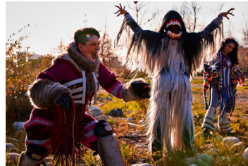
Cannupa Hanska Luger, Regalia from Sweet Land Opera: Coyotes and Wiindigo , 2020. Mixed media; 6-1/2 ft x 12 in x 8 in (each, approximate).

Regalia from Sweet Land Opera: Coyotes and Wiindigo