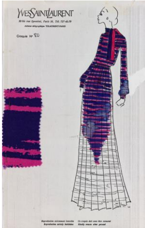
Yves Saint Laurent, sketch and fabric swatch of a dress, Haute Couture Spring-Summer 1969, Look 80.