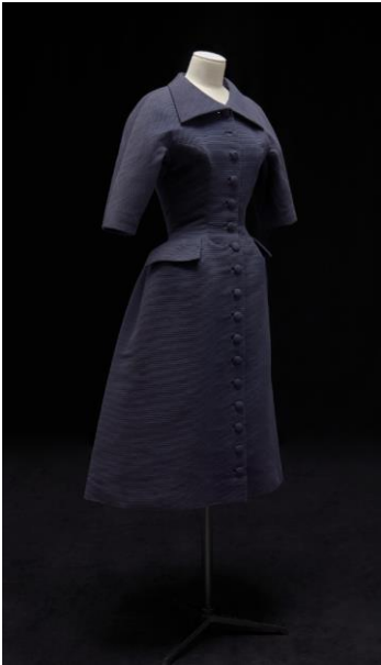
Pierre Cardin, Paris. Coatdress, Haute Couture 1951, Cotton.