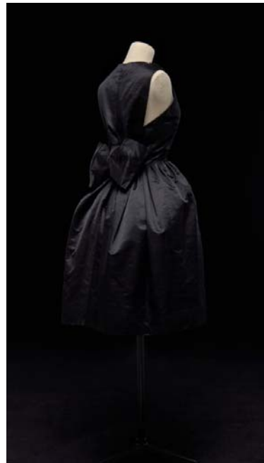
Hubert de Givenchy for Givenchy, Paris. Dress, Haute Couture Fall-Winter 1959, Silk