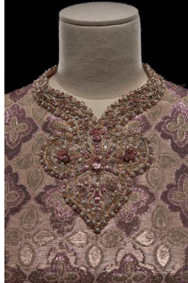
Yves Saint Laurent, Paris, Ensemble: Tunic and Pants (detail), Haute Couture Fall-Winter 1969, Look 34. Synthetic lamé by Abraham (textile house), Paris, with beading by Pierre Mesrine (embroidery house), Paris. Prototype (original runway piece).

Ensemble: Tunic and Pants (detail), Haute Couture Fall-Winter 1969, Look 34