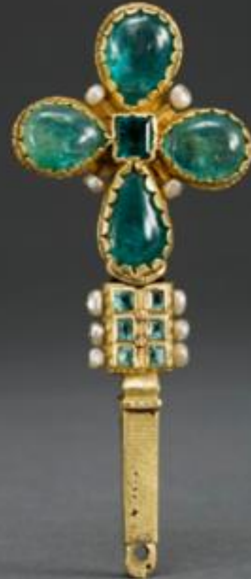
CROSS FINIAL, COLOMBIA OR ECUADOR, CIRCA 1600. GOLD, EMERALDS, PEARLS. DENVER ART MUSEUM, GIFT OF THE STAPLETON FOUNDATION OF LATIN AMERICAN COLONIAL ART MADE POSSIBLE BY THE RENCHARD FAMILY; 1990.526.

They relied on raw materials, such as silver from Mexico and Bolivia; gold and emeralds from Colombia; and coral and pearls from Central and South America.