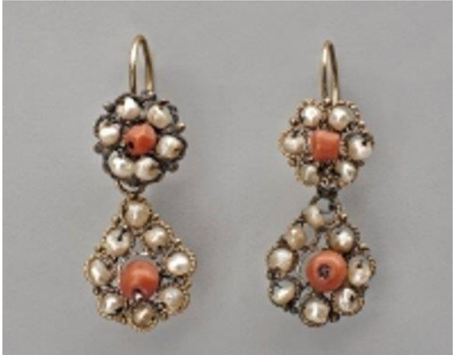
UNKNOWN MAKER. PAIR OF EARRINGS . 18TH CENTURY - 19TH CENTURY. GOLD, PEARLS, CORAL. GIFT OF THE STAPLETON FOUNDATION OF LATIN AMERICAN COLONIAL ART, MADE POSSIBLE BY THE RENCHARD FAMILY. 1990.622A-B.

During the Spanish colonial period in Latin America (1521–1850), precious gold and silver were crafted into elegant jewelry then embellished with emeralds from Colombia, coral from Mexico, and pearls from Venezuela.